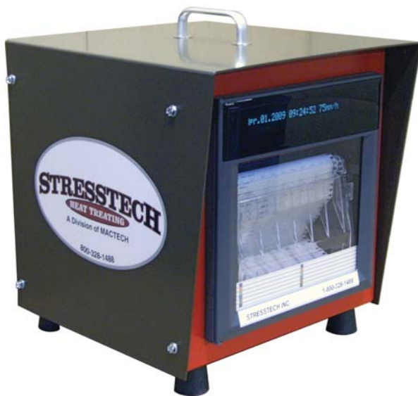
180mm Temperature Recorder