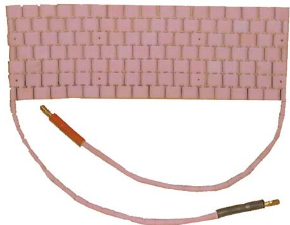
17" x 6" Element Pad