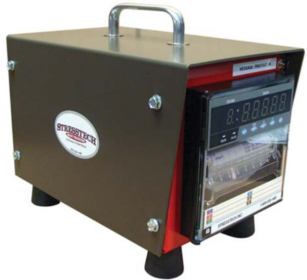
100mm Temperature Recorder

Stresstech stocks chart paper, colored ribbons, ink pads and print wheels for all major brand recorders. We also clean, adjust, repair and calibrate all temperature recorders, supplying a Certificate of Calibration traceable to the National Institute of Standards and Technology.