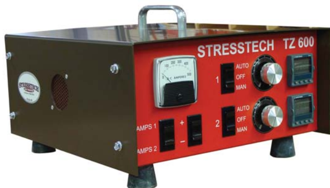
TZ 600 Twin Zone Temperature Controller

Stresstech's twin zone controller can be operated automatically (auto ramping up and down), semi-automatically (manual ramping, hold at temperature), or manually (percentage output, no temperature controller required). Each of the ramping controllers operates independently of the other, enabling the operator to begin heating cycles at two different times.