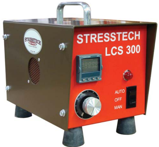
LCS 300 Single Zone Temperature Controller