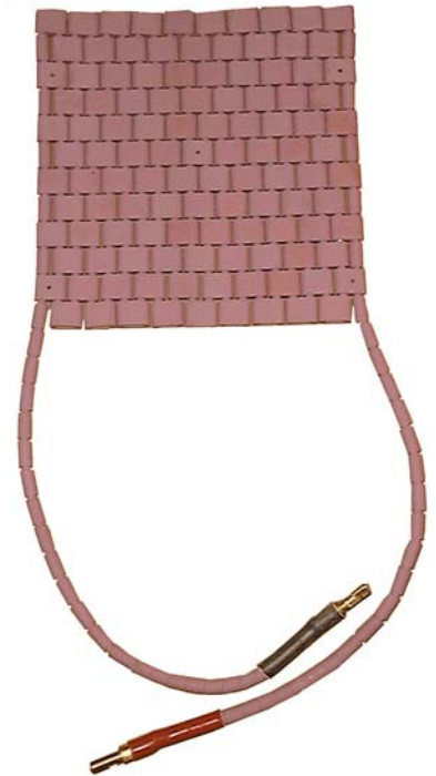
10" x 10" Heating Element